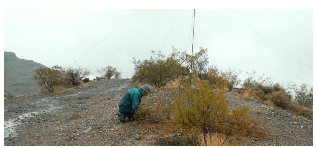
Norman replacing a water logged coax in the rain

By nine o'clock Saturday morning we were on the air, with our first contact being K6RPM on 80 meters in California. At this point we discovered that the computer and radio were not talking to one another, which forced us to use a paper log for several days. We had over 600 contacts on paper before I got