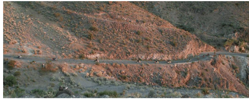
A large motorcycle group headed down to Oatman, Arizona