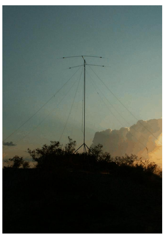
The main mast and antenna support