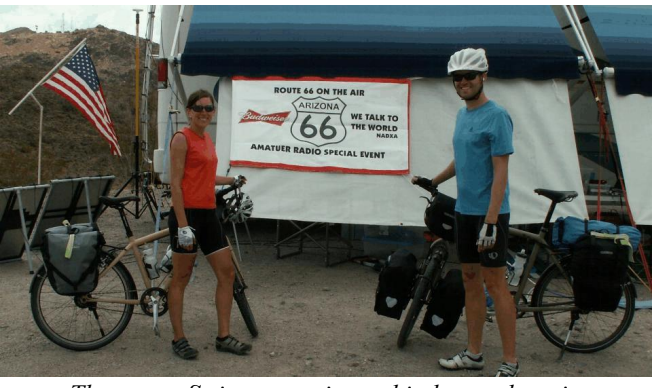
The young Swiss preparing to hit the road again

left Chicago two months earlier, enduring the summer heat as they traveled through the heartland of North America.