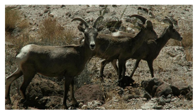
Keeping watch on the watchers