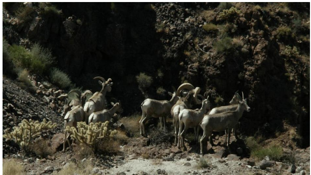
Decision time - "Down or around?"

On Monday, after "Route 66 On The Air" was over, we had another couple stop by to admire the view. Their vehicle was very interesting; it was an off-road thing with tandem axles and looked like European military