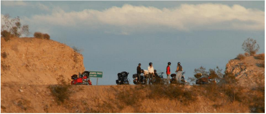
A small group taking the view from the top of Sitgreaves Pass on Route 66