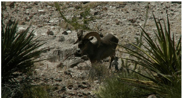
A nice set of curled horns

On Monday, after "Route 66 On The Air" was over, we had another couple stop by to admire the view. Their vehicle was very interesting; it was an off-road thing with tandem axles and looked like European military