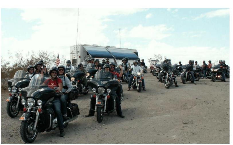
One of the larger motorcycle groups - Switzerland

We had many groups of motorcycles, ranging from a single bike to over forty bikes, most with pillion riders. them Manv of had started at one end or the other of Route 66 and were riding the entire route. The larger groups were accompanied by support teams and were well organized. Some of the smaller groups were