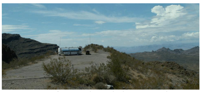
View of Memorial Point looking westward

mountaintop. They were very slow moving, pounding us with lots of rain. It was good that we routinely brought all of the electronic equipment into the motor home at night, because by daylight everything outside was soaked, even leaving a small river running under the motor home.