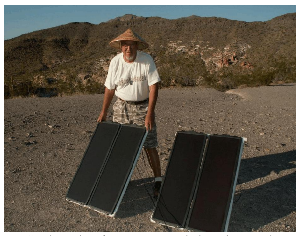
Catching the afternoon sun with the solar panels

and we logged over 180 contacts. The people playing the "Route 66 On The Air" had been looking for us, so for the remainder of the event we tried to be as available as we could, operating on the most productive bands. Then, more trouble...we ran into problems finding a hole in the bands during the weekend. There were a number of other special events, with numerous stations competing for a spot on the bands, slowing our rate of contacts down.