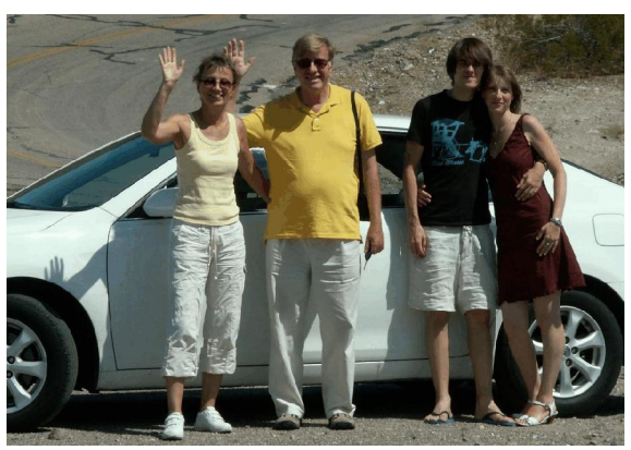
On holiday from Germany touring Route 66

People from all over the world come to the United States to travel Route 66 and they found our location at Memorial Point a good viewing area. People stopped to look at the scenery and, giving us a great opportunity to visit with them. They came from all over, but most spoke American English well enough that we could carry on an enjoyable conversation.